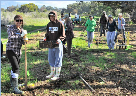
Students planting in spring

The Committee awarded $14,500 to 67 different groups (893 total participants). Over 2,300 pounds of trash were removed from local beaches.