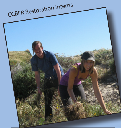
CCBER Restoration Interns

Out of the 50 applications submitted, 34 projects were funded totaling $232,091. 20 projects were funded in full and 14 projects were funded partially.