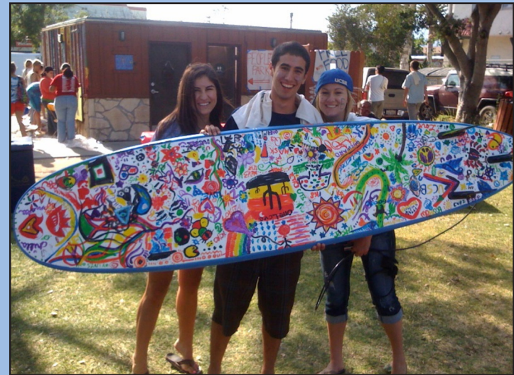
Chilla Vista surfboard raffle winners