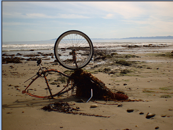
3rd - Stuart Halewood