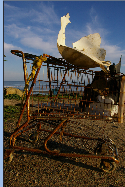
2nd - Dad Roux-Michollet